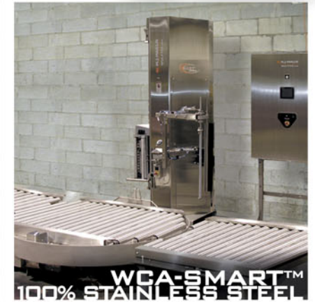
WCA-SMART™ 100% STAINLESS STEEL